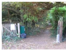
B Path by Millers House