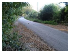
Road to All Saints

Walk along the steep sided path, passing the badgers' den on the left. The path opens to an oak wood on your left and views of Herstmonceux Place on your right.