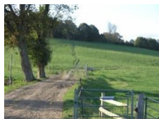
D Take the path ahead