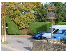
A The Welcome Stranger