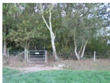
Into the wood