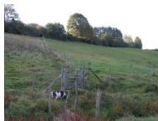
Climb the hill