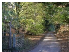
C Follow the lane

Take the diagonal path to the far left corner of the field. Go through the kissing gate and follow the narrow twitten between two fenced properties to Chapel Row and turn left into the road.