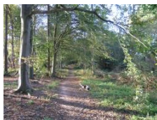
Through the wood