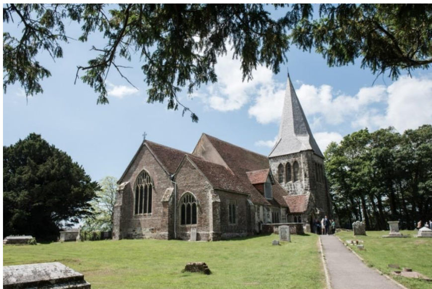
Start: All Saints Church

This walk is a figure of eight loop starting and finishing at All Saints Church, Herstmonceux. It touches on the edge of Pevensey Levels, giving views to the South Downs. The furthest point of the loop is St Mary Magdalene Church, Wartling. On the return loop the route will take you through the grounds of Herstmonceux Castle. There is limited car parking in the road by the church.