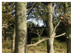
Head for the Stile