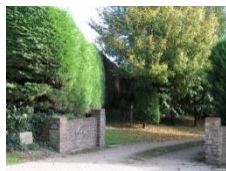
A: Church Farm House