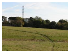
C: Path up the hill

To start, walk the short distance to the end of the road in front of All Saints church. Here turn left and right, entering the grounds of Church Farm House. Follow the footpath that skirts along the left hand edge of the garden beside the boundary with Herstmonceux Castle. The path here can be difficult with overhanging and fallen branches. Eventually you will leave the grounds of Church farm House by crossing over two stiles into open farmland( A ).