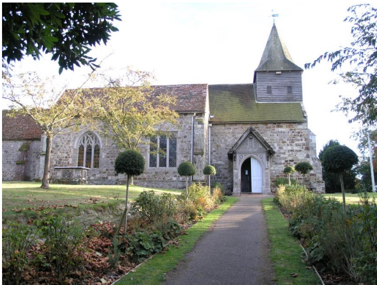
D: St Mary Magdalene Church