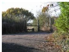
E: Stile by Little Coopers