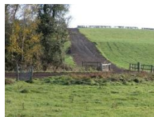
Follow the track to E .

The path lies straight ahead giving panoramic views of the South Downs. This is a large open field and the path is straight. You eventually exit via another kissing gate. The footpath takes you down diagonally left across this narrow field and exits by yet another kissing gate( A ).