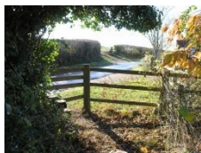
B: Cross Butlers Lane