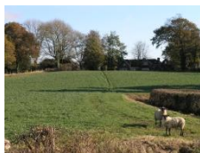
C: Cross to the far corner