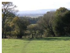
View to South Downs