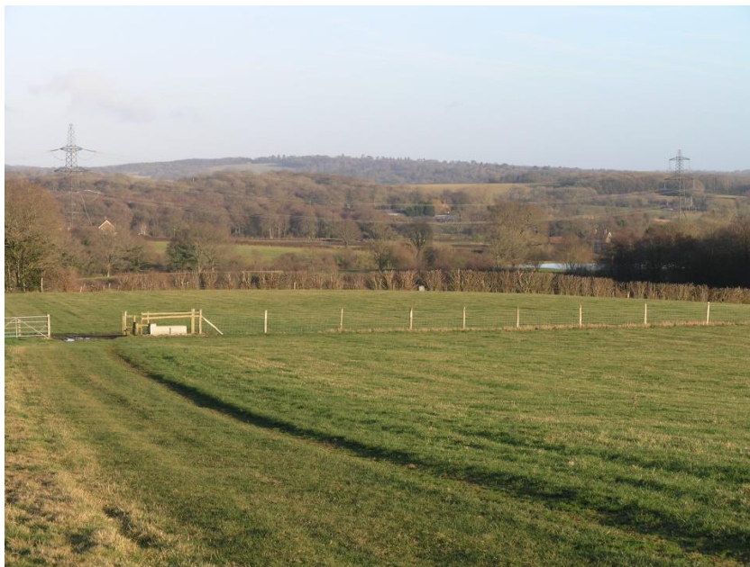
View over to Brick Farm lakes

This walk has a road section with no footpath. Care will be needed, but you will be rewarded with one of the most beautiful examples of a steep sided Sussex lane.