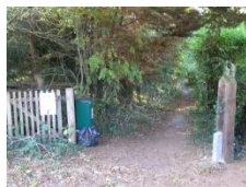
D: Down the path