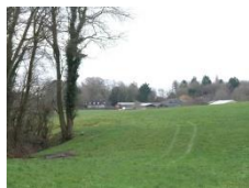
F: Bear right by the oak