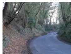
Steep sided road

Head diagonally right to join a track. Continue along the track as it passes into a large open field divided into paddocks. The track continues straight until it leaves the next field through the far boundary hedge. Be careful to follow the path that travels obliquely to the right to meet the left hand corner of a wood( B ). The path through the wood is indicated by posts, but don't worry if you go awry as the wood is narrow. On leaving the wood the path continues ahead between two of the Brick Farm fishing lakes.