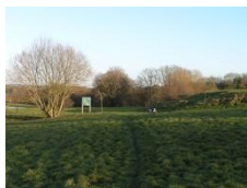
Walk between two lakes