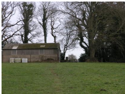
To the right of the barn

The path is indistinct but in crosses this large paddocked field straight as a die. Head for a block built barn on the horizon. Pass to the right of the barn and out through a double kissing gate into another open field. Bear left and follow the path past a large oak tree to the final kissing gate(J) into Herstmonceux Recreation Ground. Keep to the right and walk down back to the centre of the village.