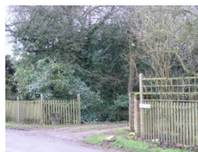
G: Right into the drive