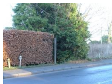
A: Starting footpath